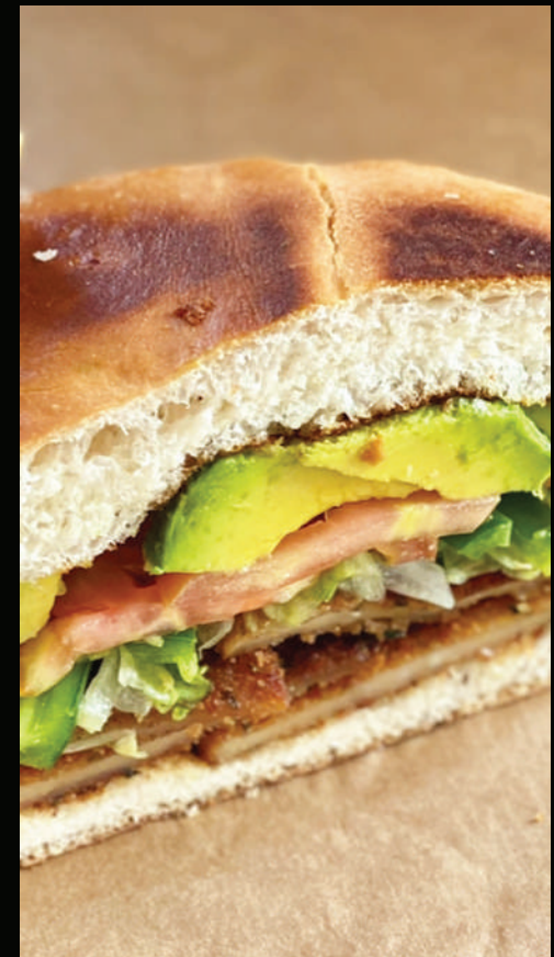
TORTA de POLLO $10.99