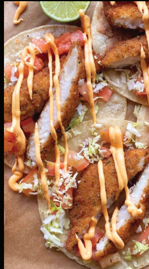
TACOS de PESCADO $11.99