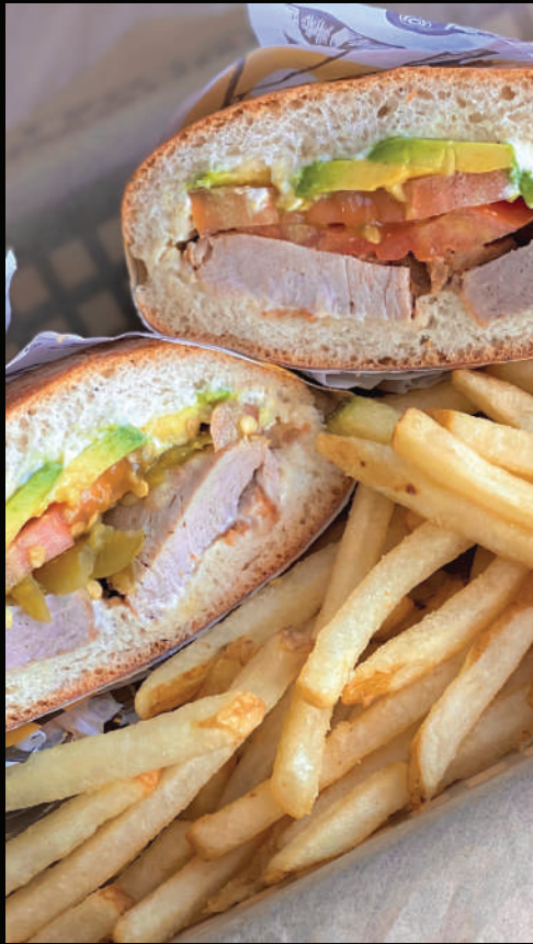
TORTA PAQUIMÉ $9.99