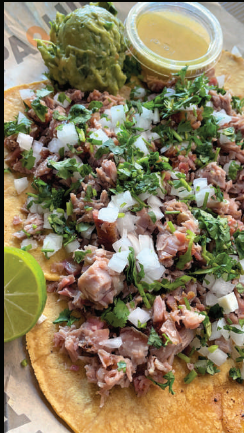
TACOS de CARNITAS $11.99