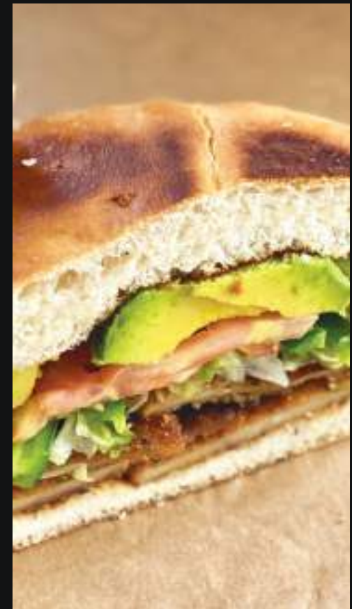
TORTA PAQUIMÉ $9.99